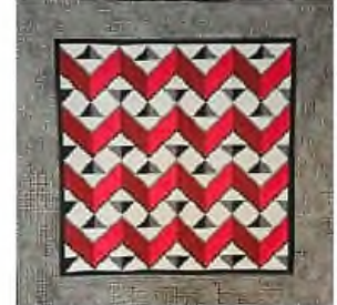
"This, No That" 38-1/2" x 38-1/2"